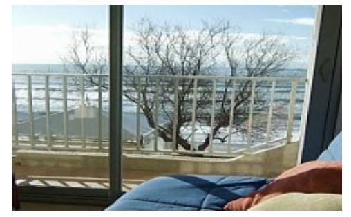
This pull-out couch can be used as a third bed in Seaview Apartment!