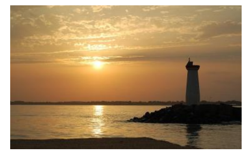
Seaview Apartment - the name says it all! Here is the beautiful view that you'll be seeing from this wonderful apartment.