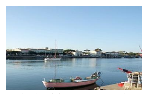
Another view of what you can see every day at Seaview Apartment.