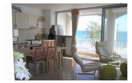
Here is an overall view of Seaview Apartment's kitchen, living room and dining room, with of course the beautiful view of the sea.