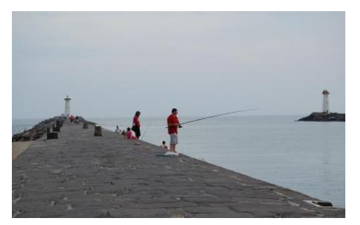
Fishing in Grau d'Agde!