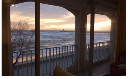
Here is Seaview Apartment's balcony, complete with 2 small tables and chairs, and a BBQ. This really is an amazing place to just sit back and enjoy the beautiful view.